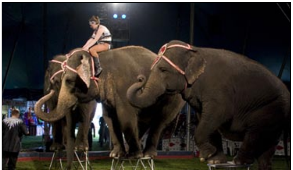
RIDING HIGH — The Carson & Barnes Circus brought its big tent to campus for two shows on March 28 and A&M-Commerce staff took the opportunity to ride the elephants. The elephants were a crowd pleaser during the 71st annual tour of the circus.